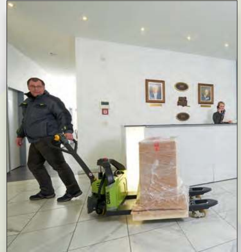
Ideal for use in logistics and retail