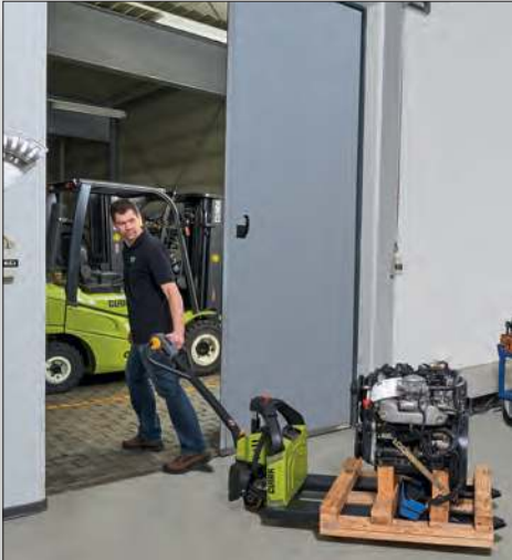
Ideal for use in industrial applications