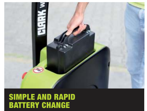
SIMPLE AND RAPID BATTERY CHANGE

Intermediate charges can be used to avoid downtime for recharging the battery. The Li-Ion battery thus ensures maximum availability. No gases are released when the Li-Ion battery is charged. Therefore, there is no need for ventilated charging rooms. Exchangeable batteries and additional external chargers are also available.