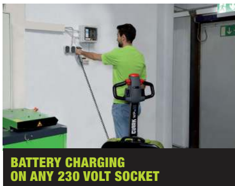
BATTERY CHARGING ON ANY 230 VOLT SOCKET

The WPio15 is a versatile low-lift truck with a load capacity of 1.5 tons, suitable for various tasks of daily material transport. The truck is equipped as standard with an integrated charger and can be charged at any 230-volt socket. Thanks to the mounted castor wheels, the truck has excellent cornering characteristics, thus ensuring safe and efficient transport of goods.